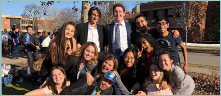
UCSB Mock Trial ready to take on the first round at UCLA.